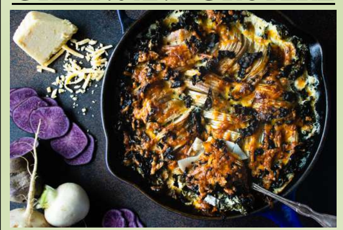
Adapted from https://www.kate-cooks.com/blog/turnip-amp-potato-gratin-with-greens-amp-gruyere