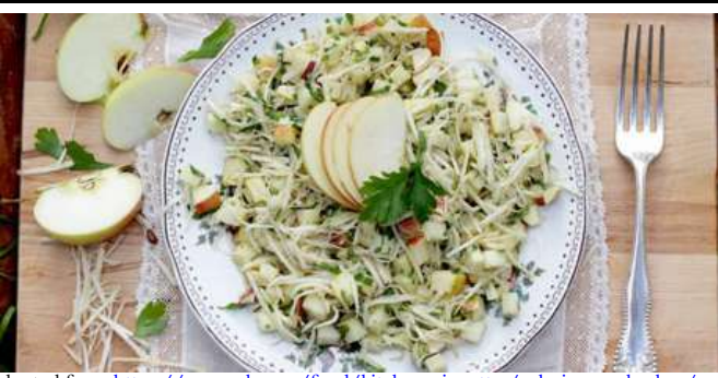
Adapted from <a href="https://www.pbs.org/food/kitchen-vignettes/celeriac-apple">https://www.pbs.org/food/kitchen-vignettes/celeriac-apple</a>