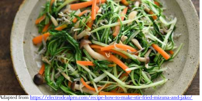
Mizuna lends itself well to stir-fries with other thinly chopped

Mizuna lends itself well to stir-fries with other thinly chopped veggies, such as carrots & leeks, and mushrooms, seasoned with a little soy sauce/tamari, garlic, & salt. Serve with rice & enjoy!