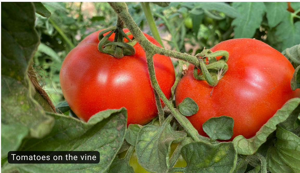
Tomatoes on the vine